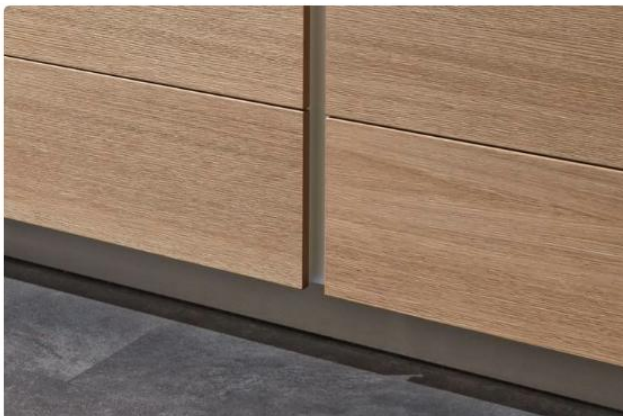
Trendline metal 1 Stainless steel handle profile.

With the handleless kitchen, you grasp the front from behind to open it. A small shell handle, invisible from the front, is milled in at an ergonomic height for this purpose. Perfectly technically sophisticated down to the last detail: in our vertical solution, the strip installed between two tall units conceals the carcass front edge.